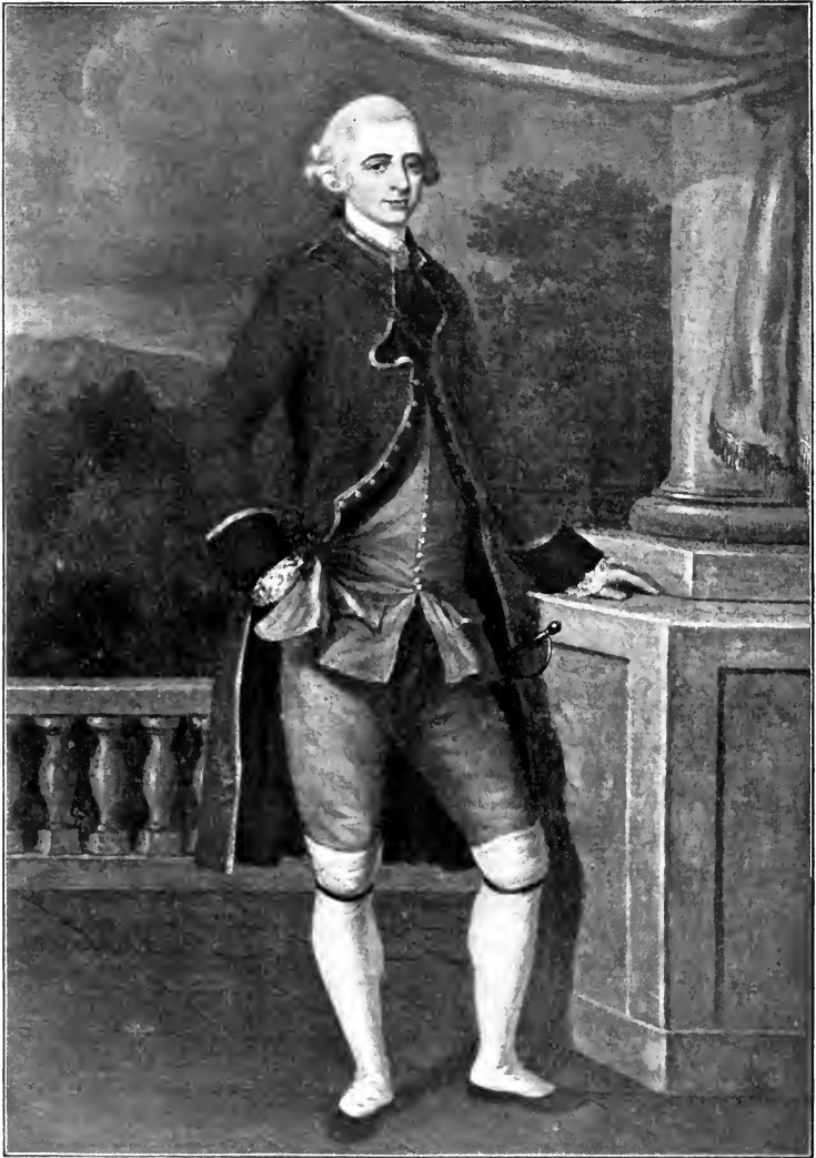
SIR ROBERT EDEN (1741-1784).

GOVERNOR OF THE PROVINCE OF MARYLAND 1768-1776.